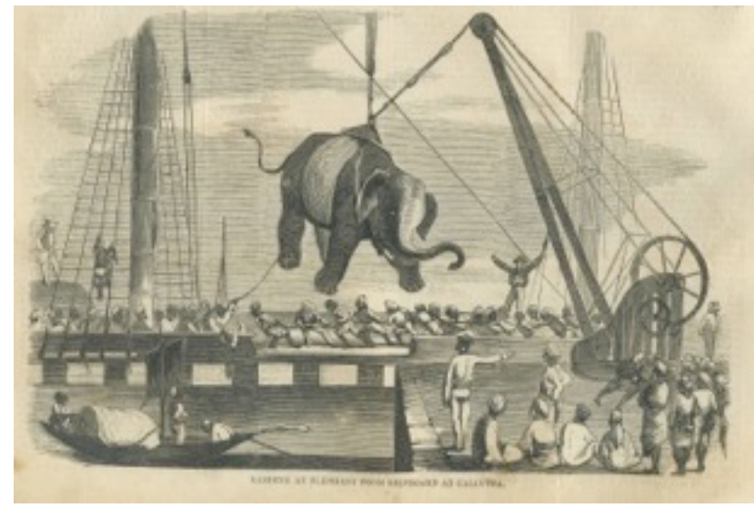
Harpers Weekly, 1858

Since the early 1800s they have been captured from the wild and exported to zoos and circuses around the world, for use in the entertainment industry.